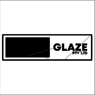
#: 2 Color: Black Code: 13 Brand: Wilcom Stitches: 20995 Thread Used: 137.33m