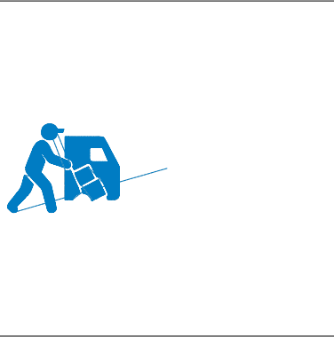
#: 1 Color: Sky Blue Code: 21 Brand: Wilcom Stitches: 6506 Thread Used: 119.12ft