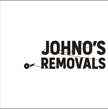
#: 2 Color: Black Code: 13 Brand: Wilcom Stitches: 7585 Thread Used: 202.90ft