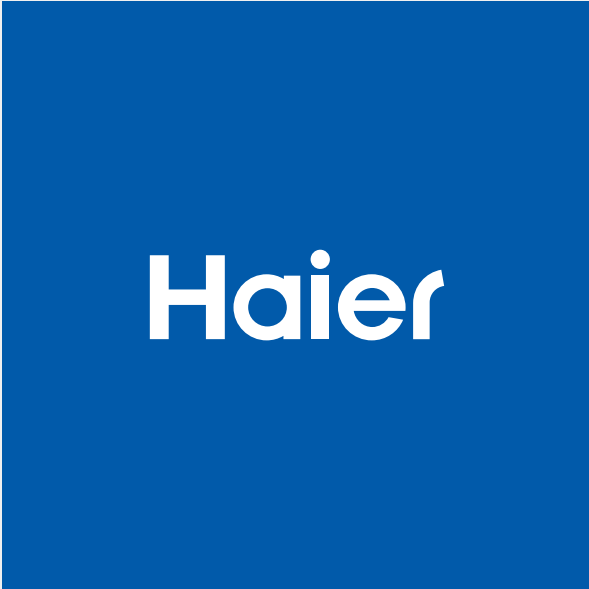
White on Dark Blue